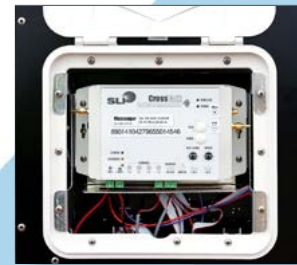
SLI's proprietary communication system, the CrossTalk® provides wireless functionality globally.