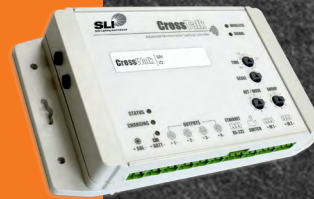
CrossTalk Advanced Lighting Controller