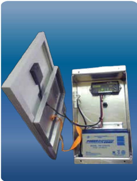
Compact Battery Cabinet

Diamond Grade Sheeting: for optimal reflectivity.