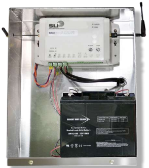
A clean solar traffic control box means easy repairs when needed

Solar Lighting International, Inc. will also custom-design a school zone warning solution to meet any specifications.