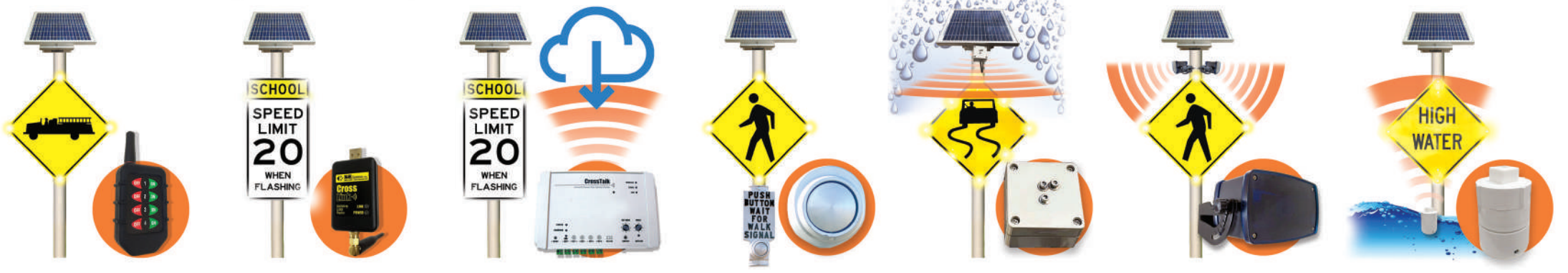
Remote Activation Cross Link Crosstalk Crosswalk Push Button Moisture Sensor Motion/Radar Sensor High Water Sensor